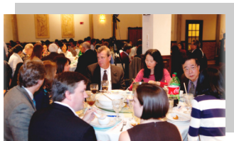
Gold Sponsor Moore Colson Table at the 2010 Fall Fundraising Dinner

“It is more blessed to give than to receive.” Acts 20:35