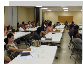
Attendees of our ACCESS seminar on "Priorities" at ACCCN last September