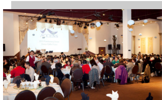
Fundraising Dinner Guests